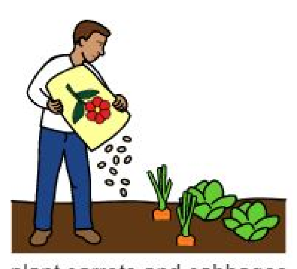
plant carrots and cabbages